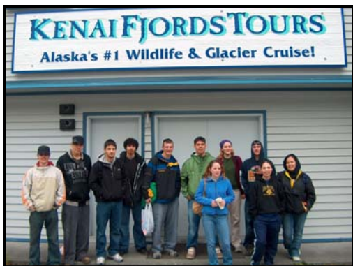
ANSEP Summer Bridging Students 2006

ANSEP Biological Sciences Summer Bridging Program is a 10 week summer program that will pay you up to $5,400 (combined summer wages and scholarship) for college. ANSEP Sponsors pay the majority of your expenses, so you show up with a positive attitude, ready to work, and ready to have fun. This could be the most important summer of your life!