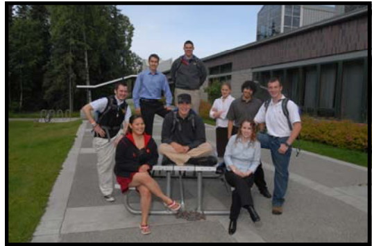
ANSEP Summer Bridging Students

Building a National Model for Excellence in Native American Higher Education Programs